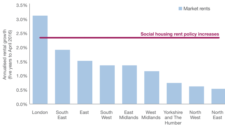
FIGURE 2 Regional variation in rental growth in contrast with national social rent policy