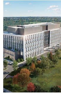
440 Bedford Street