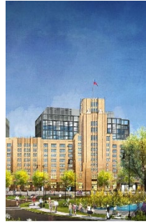
421 Park Drive