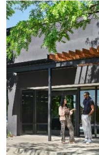
Wilderness Labs Building I