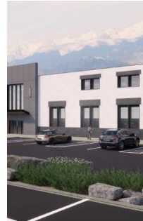
Centennial Valley Innovation Center