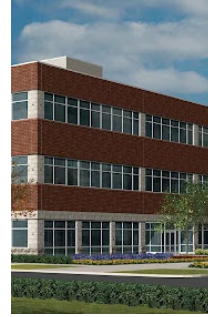
M Station West