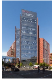
201 Tabor Road