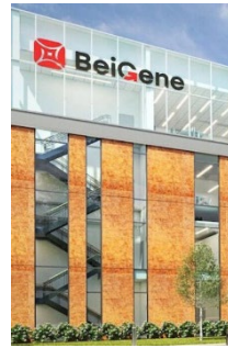
BeiGene Building Complex