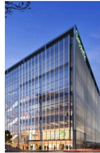
Roche Global Center