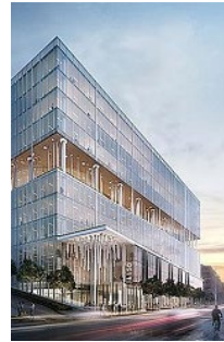
2300 Market Street