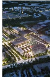
VIVA White Oak