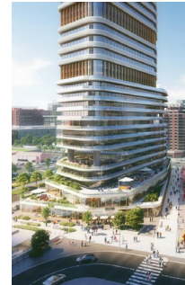
North Bethesda Metro Station